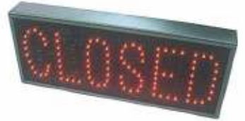
Both the "Open" and "Closed" messages are housed in the same sign