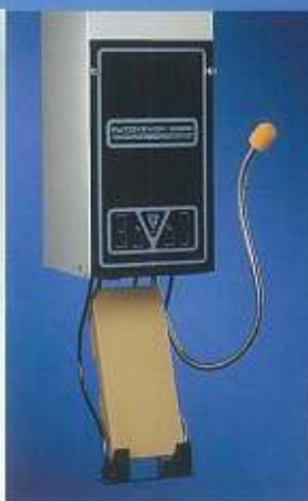
Teller controls feature power, cancel, recall, and audio