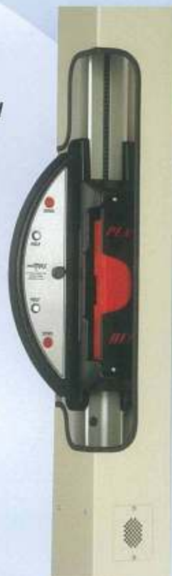
Optional housing shown with Car/Truck Model TransTrax ®

TransTrax ® does not take up any valuable counter space and provides an excellent line of sight between customer and teller.