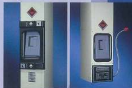
Dual height start and call buttons