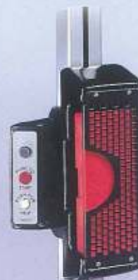
Economical Basic Model TransTrax ®

TransTrax ® is both a UL listed and classified product.