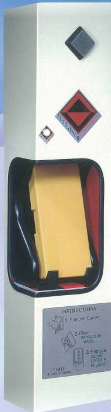
Customer vertical with microphone, speaker and call button

Tellers praise the cancel and recall features as well as how quiet the system operates. With the Autoveyor®, they can converse with the customer even while the system is in use.