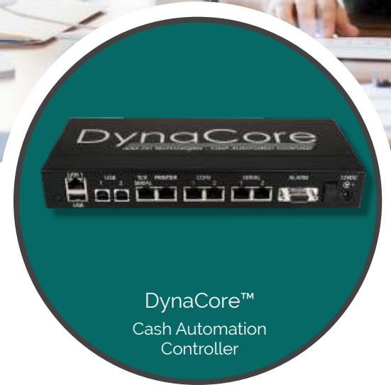
DynaCore™ Cash Automation Controller